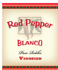
Red Pepper Blanco 7.50 / 28